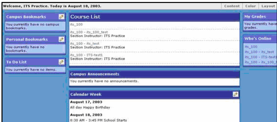
Figure 3. MyVista page